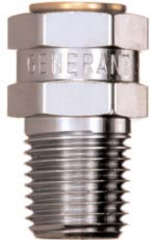
VRV Vent to Atmosphere

(based on sealing selection, see ordering information)