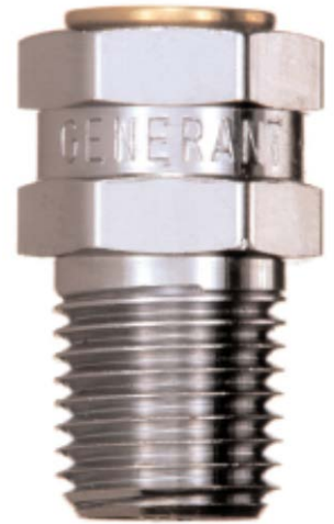
VRV Vent to Atmosphere

(based on sealing selection, see ordering information)