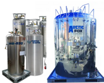
Cylinders & Tanks